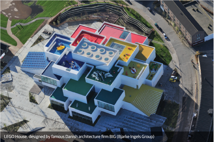
LEGO House, designed by famous Danish architecture firm BIG (Bjarke Ingels Group)